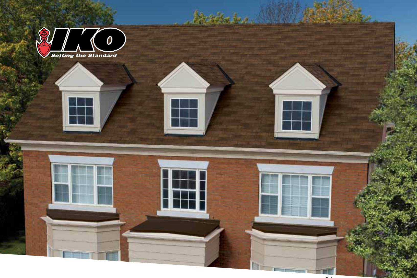
Color Featured: Dual Brown