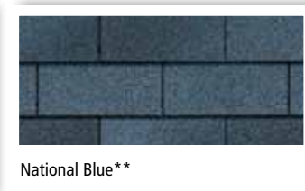
National Blue **