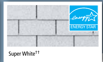
Super White ††